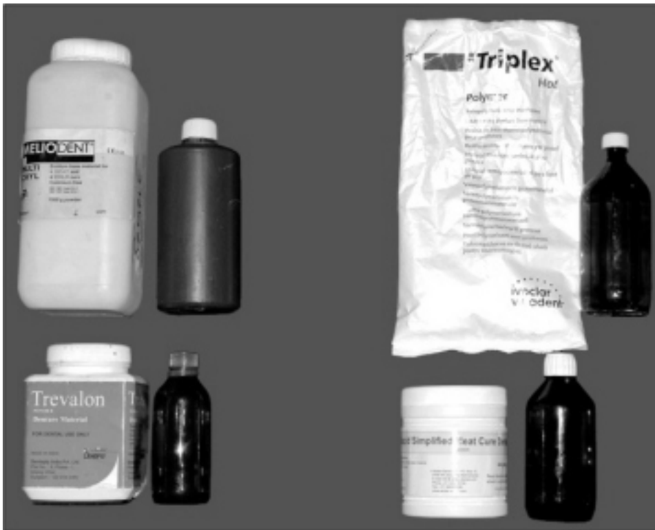
Fig 1. Four different heat cure materials used