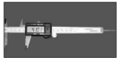
Fig 3. Digital Vernier Caliper

The tip of the stainless steel pin was marked with blue color and the marks were transferred onto the paper and the measurements were taken with the help of digital vernier caliper (Fig 3 and 4) between two points i.e. molar to molar and molar to central incisor.