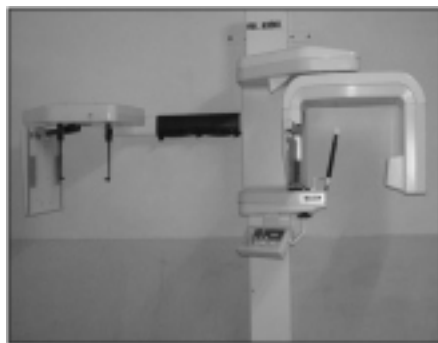
Fig 1- Planmeca X-ray machine with model no: 2002

The mean, standard deviation and P value were calculated for each parameter. ANOVA analysis was performed and highly significant differences were found in Beta angle, Yen angle and W-angle in all the three Groups (Group I, Group II, and Group III) (Table I)